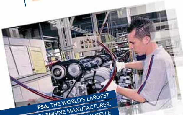
PSA, THE WORLD'S LARGEST DIESEL ENGINE MANUFACTURER. 2 PLANTS IN MOSELLE.