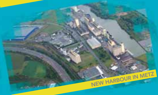
NEW HARBOUR IN METZ

■ Intersection of two major motorway networks running North-South (A31-E25) and East-West (A4-E50). Efficient main road network. Strategically positioned along the Eurocorridor, the road network linking North Sea ports to Spain, the Mediterranean and Italy along the Rhône corridor.