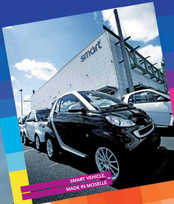
SMART VEHICLE, MADE IN MOSELLE