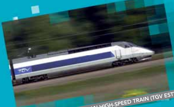
EAST EUROPEAN HIGH-SPEED TRAIN (TGV EST)

■ The Bettembourg-Perpignan rail corridor provides a multimodal road/rail link between the North and South of Europe.