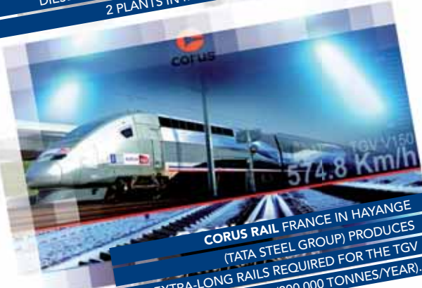
CORUS RAIL FRANCE IN HAYANGE (TATA STEEL GROUP) PRODUCES THE EXTRA-LONG RAILS REQUIRED FOR THE TGV HIGH-SPEED TRAIN (300,000 TONNES/YEAR).