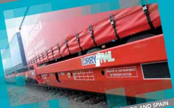
ROAD/RAIL TRANSPORT BETWEEN LUXEMBOURG AND SPAIN