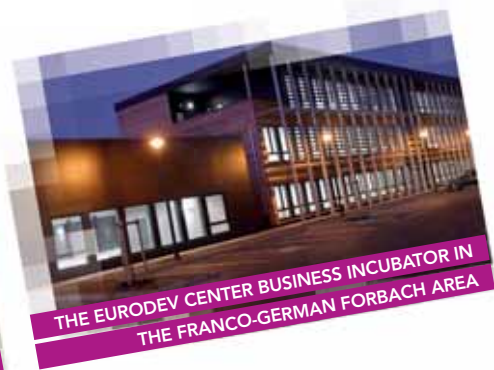
THE EURODEV CENTER BUSINESS INCUBATOR IN THE FRANCO-GERMAN FORBACH AREA