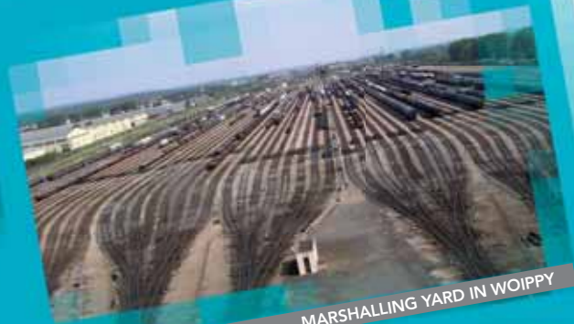
MARSHALLING YARD IN WOIPPY