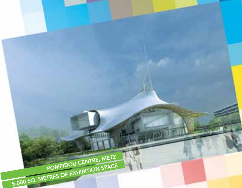
POMPIDOU CENTRE, METZ 5,000 SQ. METRES OF EXHIBITION SPACE