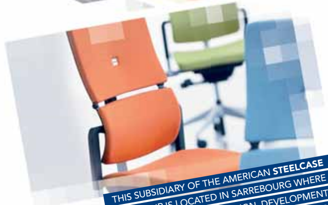
THIS SUBSIDIARY OF THE AMERICAN STEELCASE INC GROUP IS LOCATED IN SARREBOURG WHERE IT SPECIALISES IN THE DESIGN, DEVELOPMENT AND MANUFACTURE OF OFFICE SEATING.