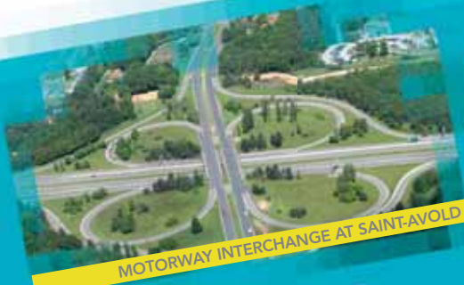
MOTORWAY INTERCHANGE AT SAINT-AVOLD