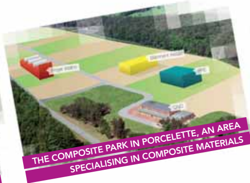
THE COMPOSITE PARK IN PORCELETTE, AN AREA SPECIALISING IN COMPOSITE MATERIALS