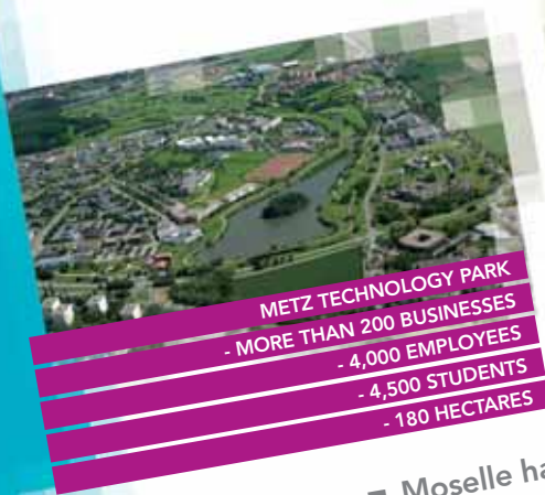
METZ TECHNOLOGY PARK - MORE THAN 200 BUSINESSES - 4,000 EMPLOYEES - 4,500 STUDENTS - 180 HECTARES