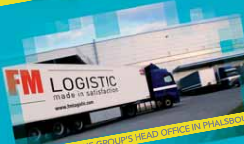
FM LOGISTIC, THE GROUP'S HEAD OFFICE IN PHALSBOURG