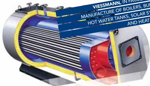
VISSMANN, IN FAULQUEMONT: MANUFACTURE OF BOILERS, BURNERS, HOT WATER TANKS, SOLAR SYSTEMS AND HEAT PUMPS.